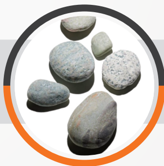
PRESENCE OF STONES