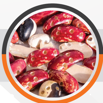
BEANS EATEN BY INSECTS